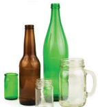
Glass Bottles and Jars Botellas y Envases de Vidrio

...easier than ever, just mix it together!